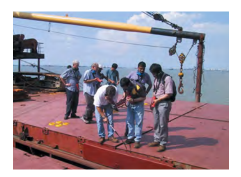
to theoretical exercices ...